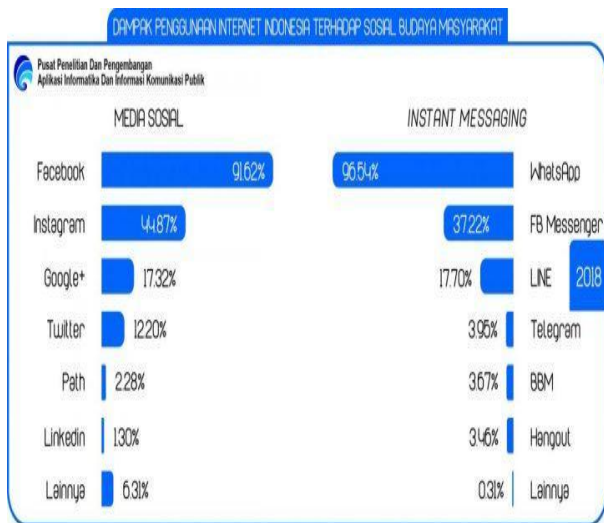
Figure 2. Impact of Indonesian Internet Use (APTIKA KOMINFO)

Data on the impact of internet use in Indonesia also tends to be high on social media in 2018 [5] alone the percentage level of social media use is as shown below,